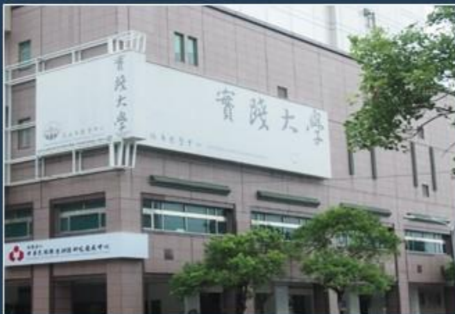
Kaohsiung Downtown Campus