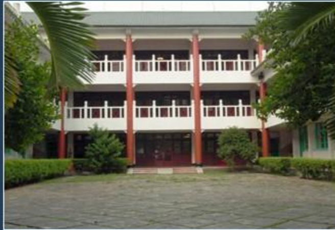
Changhua Extension Center of Home Economics